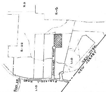
VICINITY MAP SCALE: 1" = 1000'